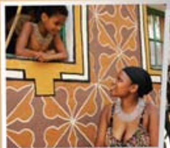
the morning's adventures are being told in detail...