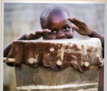
Learning the beat of Africa through drumming