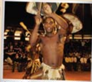
Energetic dance tells the stories of ancestors and victories fought