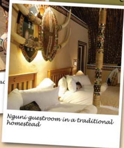
Nguni guestroom in a traditional homestead