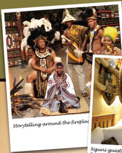
Storytelling around the fireplace